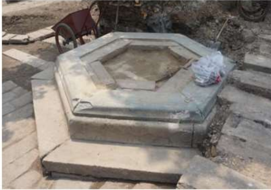
The base of the silk burning furnace excavated from the Tiezhu (铁柱) Wanshou Palace site