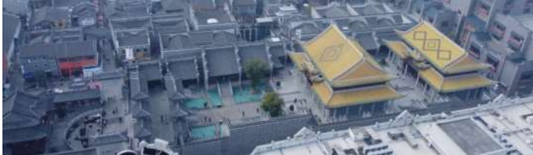
Aerial view of the Wanshou(万寿) Palace Historical and Cultural Block