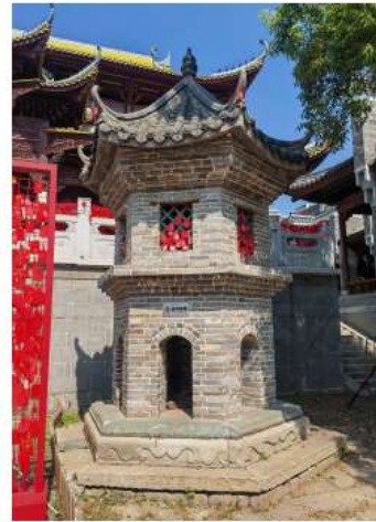
The silk burning furnace in the Tiezhu (铁柱) Wanshou Palace after renovation